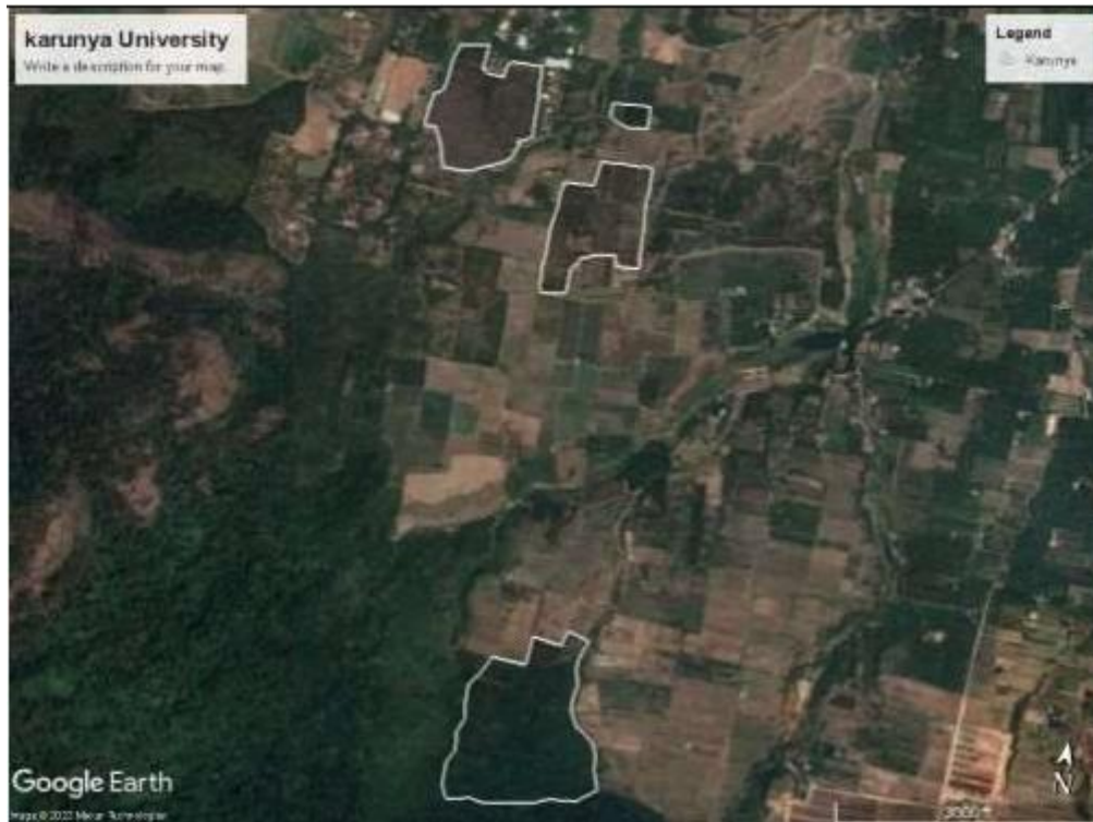
Total Forest Vegetation Area (Karunya Institute of Technology and Sciences)