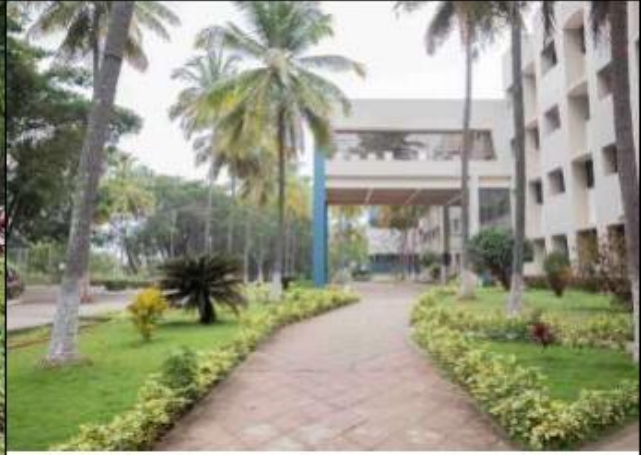
Agri Block corridor(Inside)