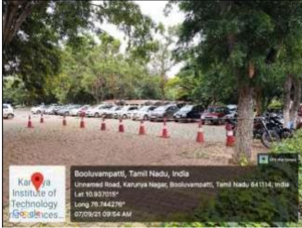
Vehicle Car Parking

[1.11] Total area on campus for water absorption besides the forest and planted vegetation (meter 2 )