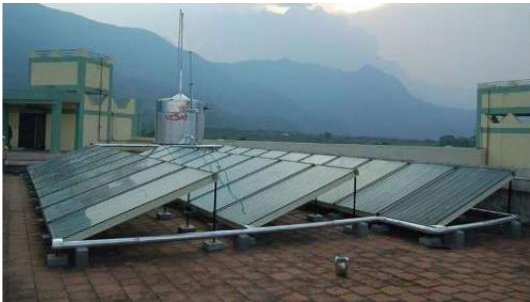
Solar Water Heating System