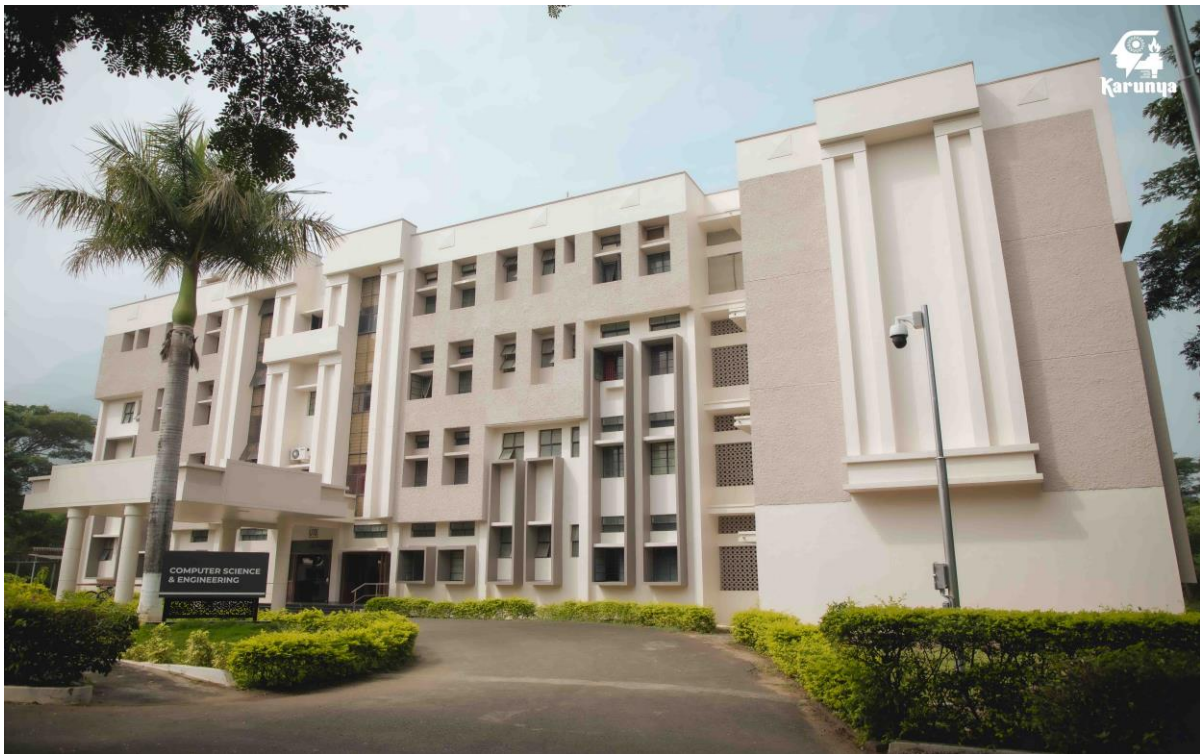
Computer Science and Engineering