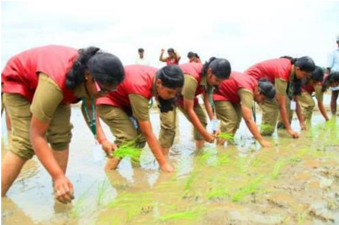
Paddy – Transplanting in the Main Field