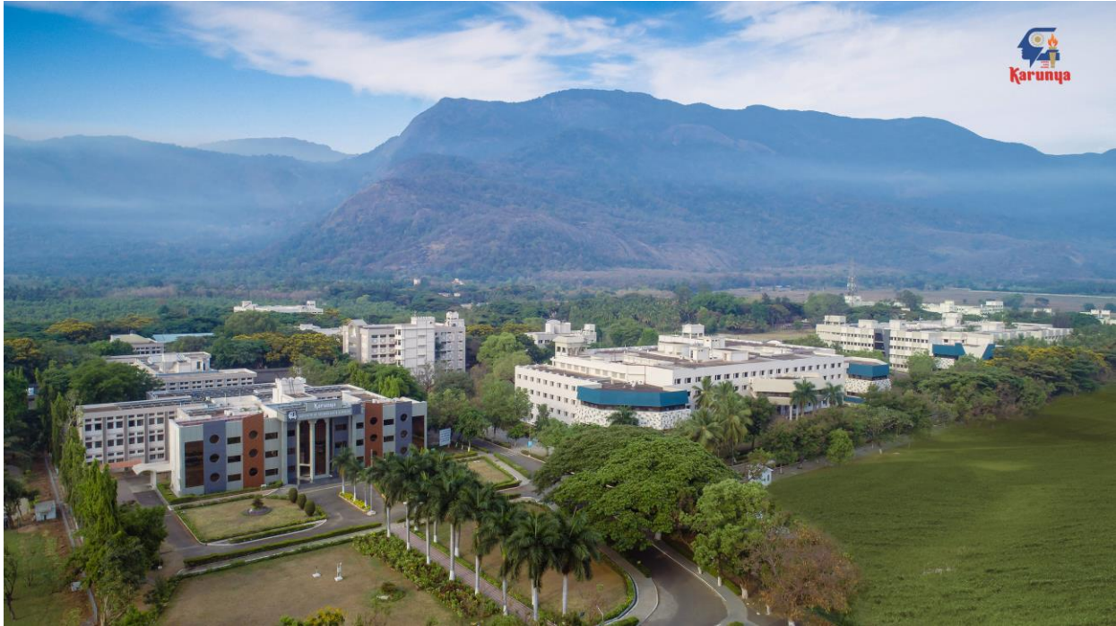
KITS Aerial View