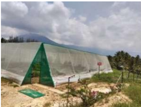
Shadenet house at North farm