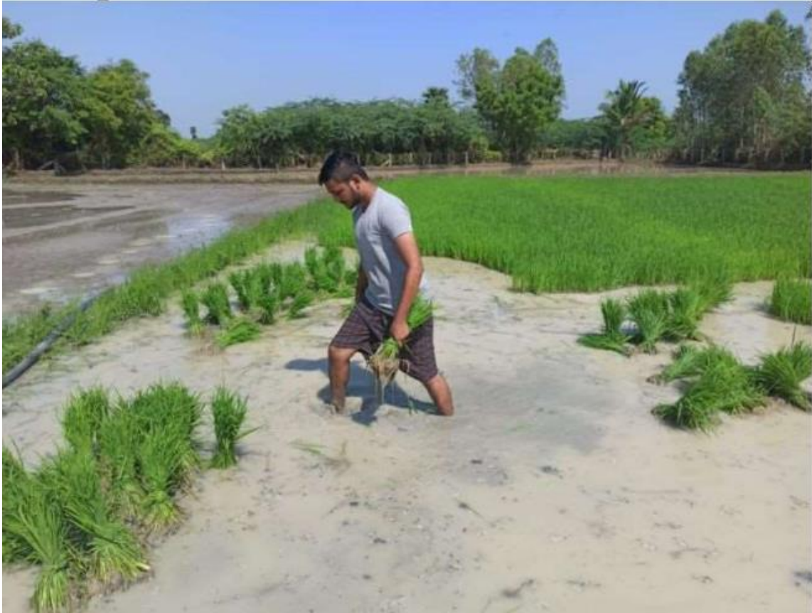
Paddy - Ready for Transplanting