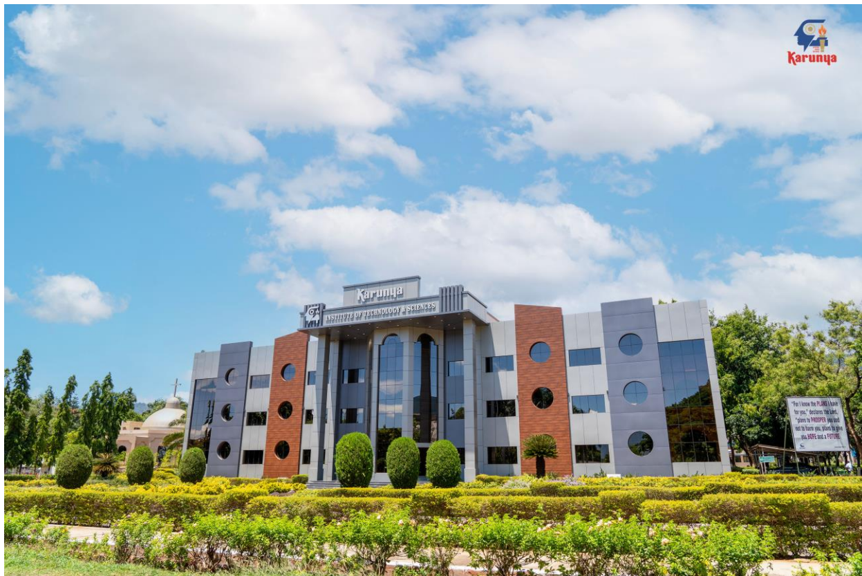
KITS Administrative Block