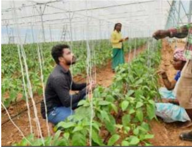
Polyhouse at North farm