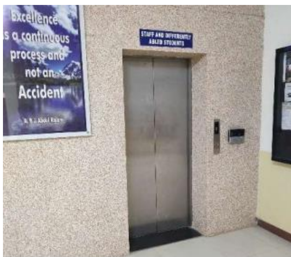
Elevator at the School of Agricultural Sciences