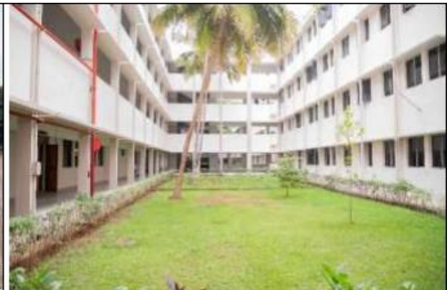
Agri Block corridor(Outside)