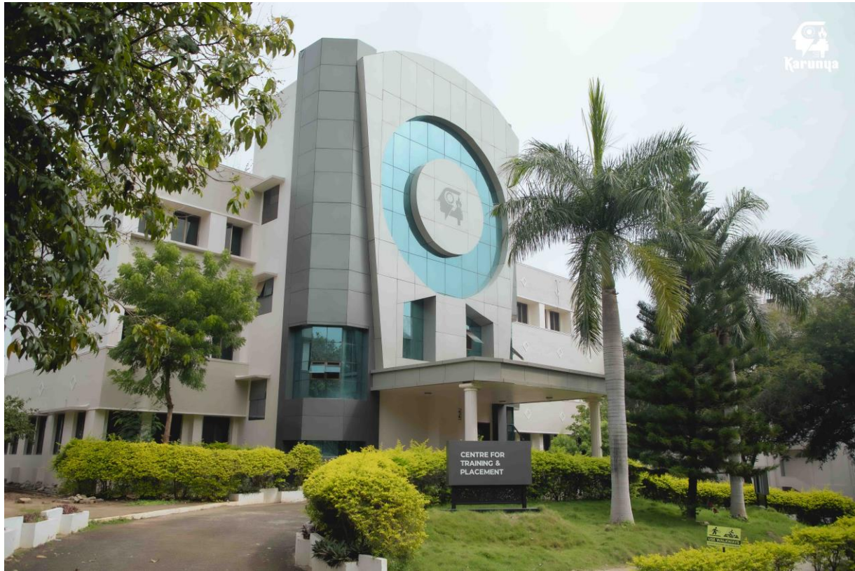
Centre for Training and Placement