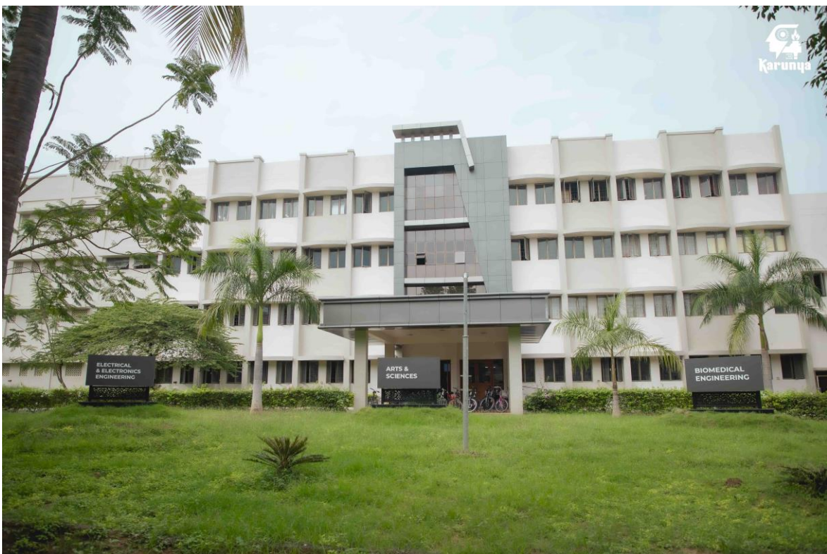
Electrical and Electronics Engineering, Biomedical Engineering, Arts and Sciences