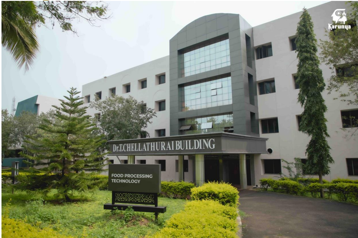
Food Processing Technology