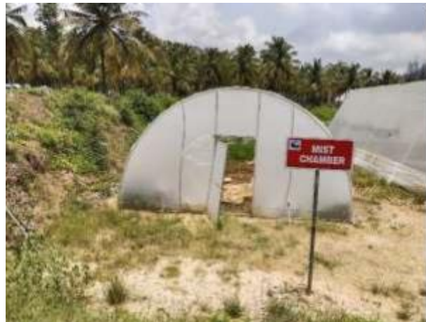
Mist chamber at North farm