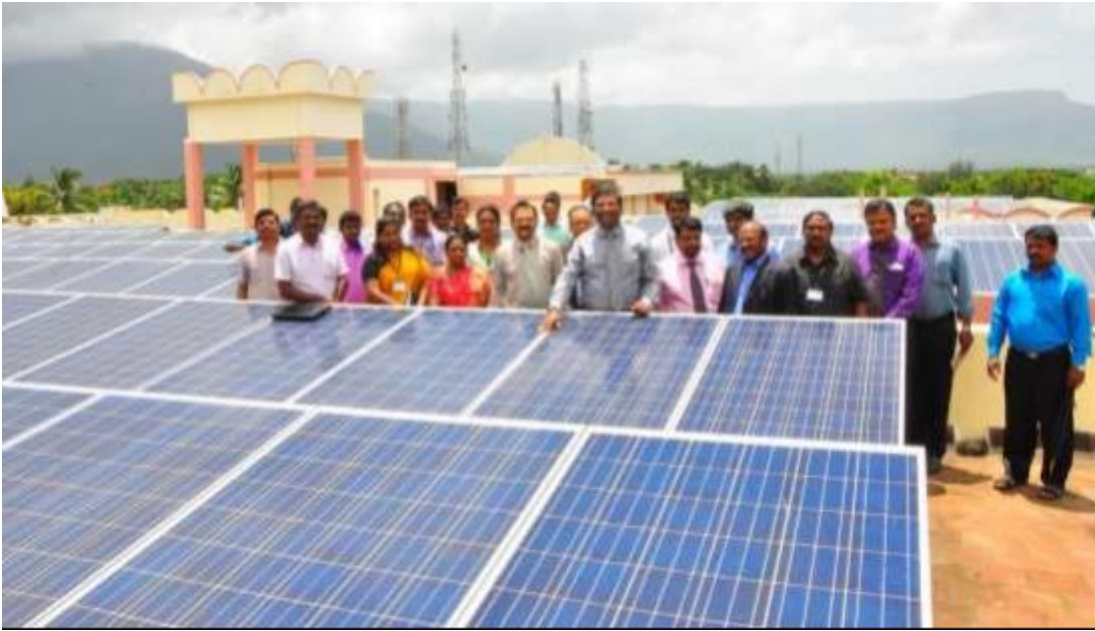
Solar Power Plant