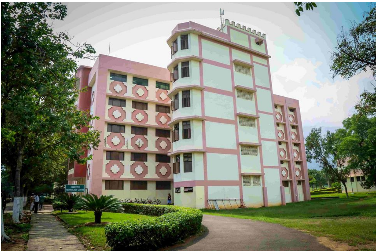
Computer Technology Centre