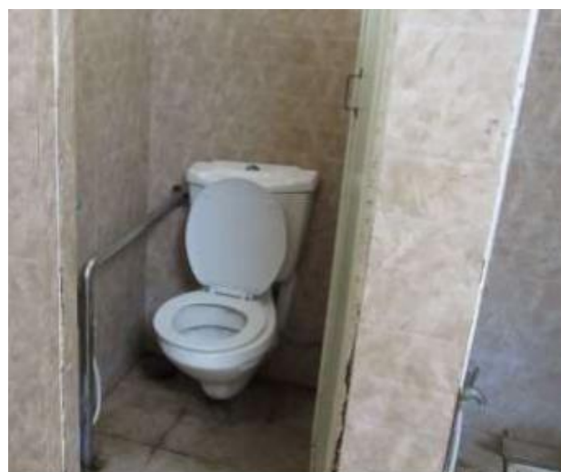
Lavatory at the aerospace block