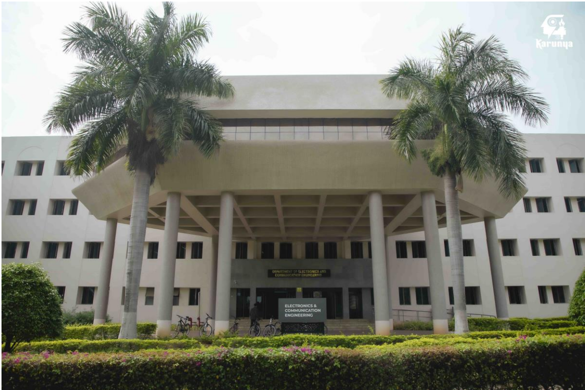
Electronics and Communication Engineering