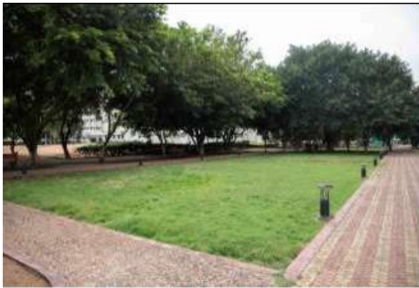
Hostel front yard