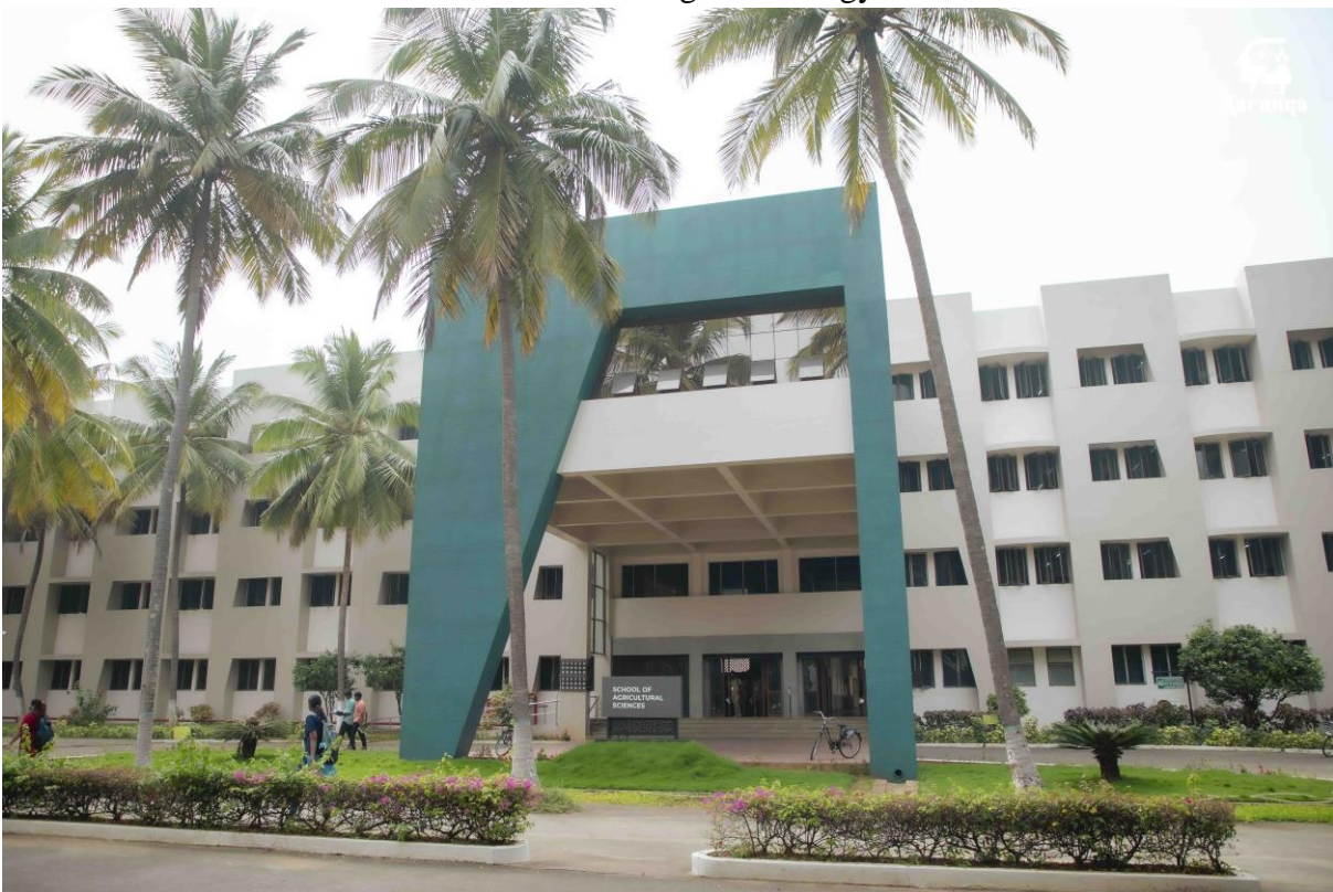
School of Agriculture Sciences