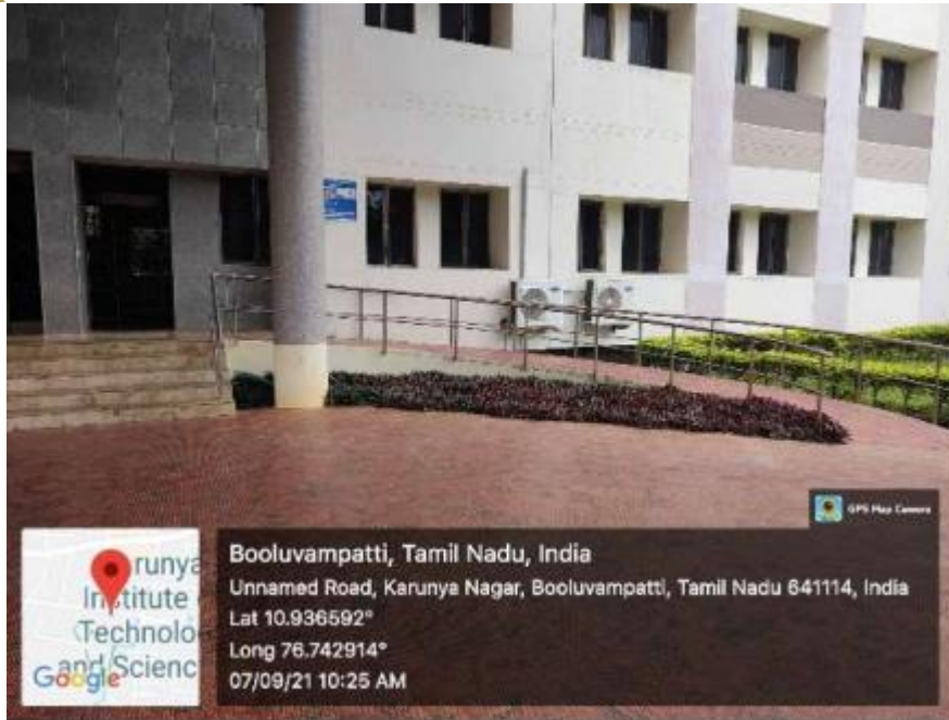
Ramp at the entrance of the ECE department