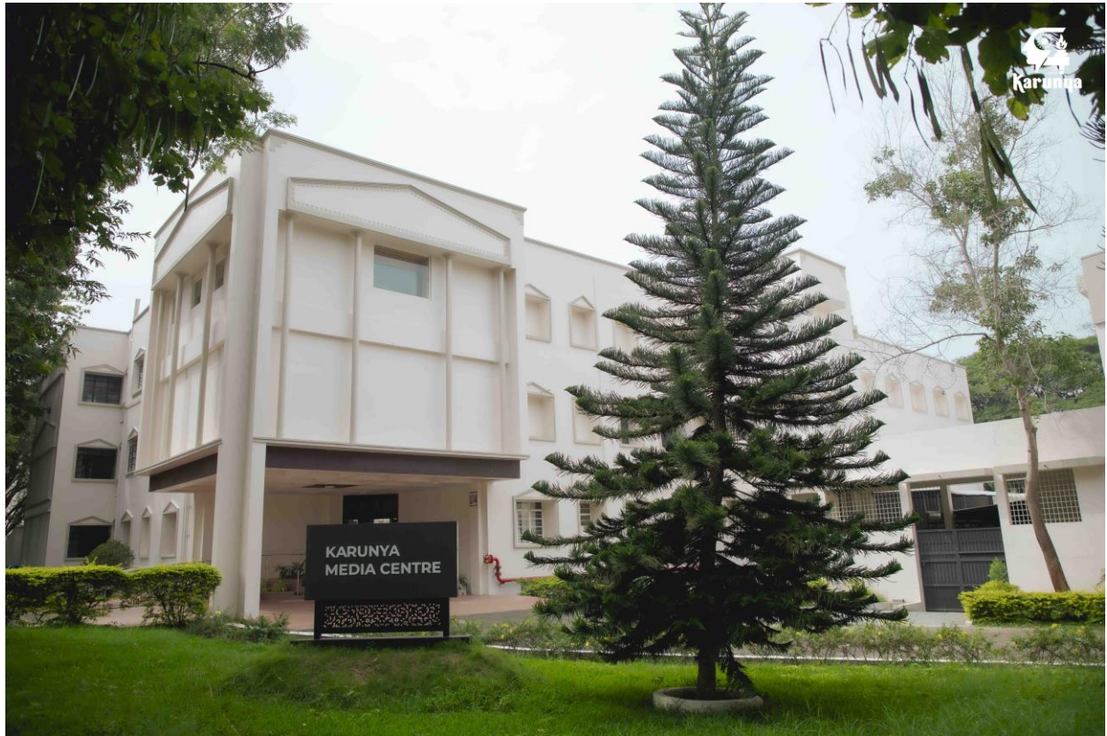
Karunya Media Centre