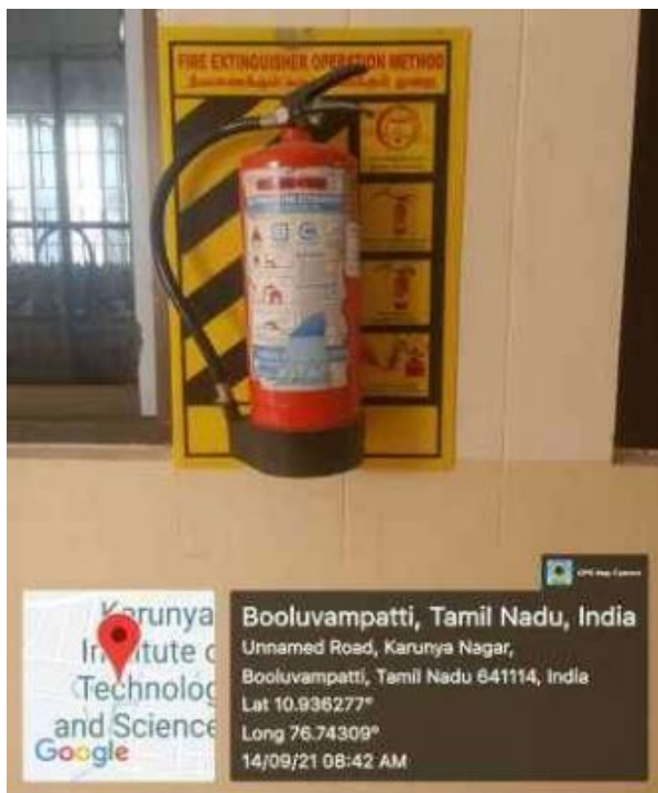
Fire Fighting System